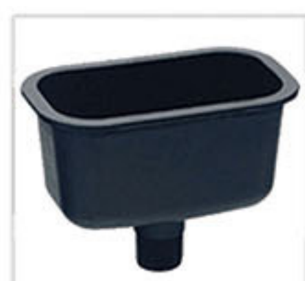
PP Sink resistant to acid, alkali and anti-corrosion