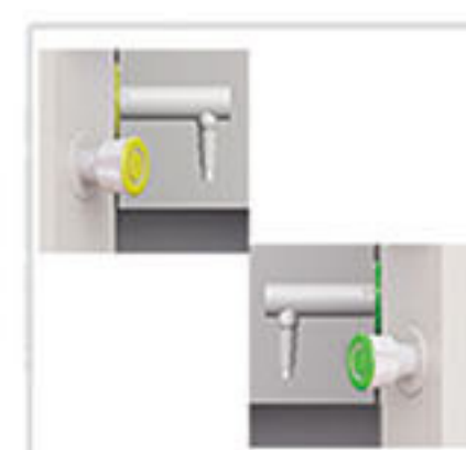
Water&Gas Remote Control