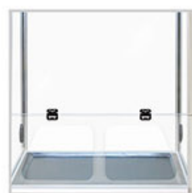
Folding acrylic front window, down part with free stop function