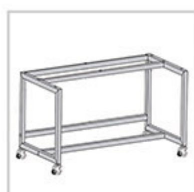
Base Stand Optional