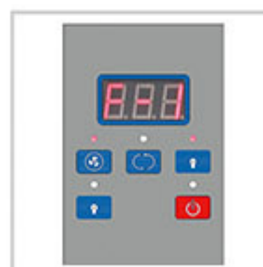
LED Display Digital LED display: Airflow Level