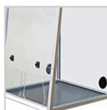
Three Side Glass Windows Back&Side glass windows maximize light and visibility, providing a bright and open working environment