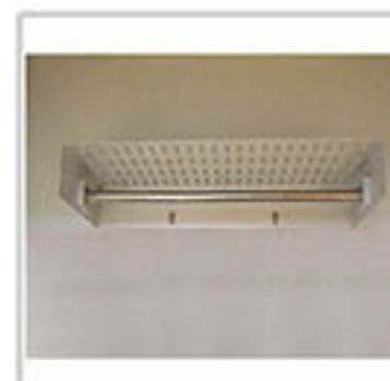
Shelf with IV Bar

UV Lamp Emission of 253.7 nanometers for most efficient decontamination.