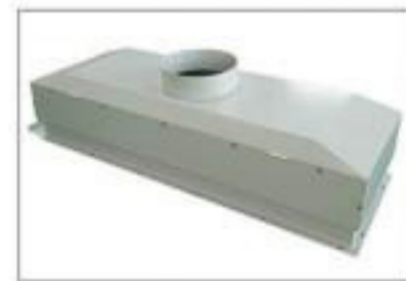
Exhaust Thimble canopy(Optional)