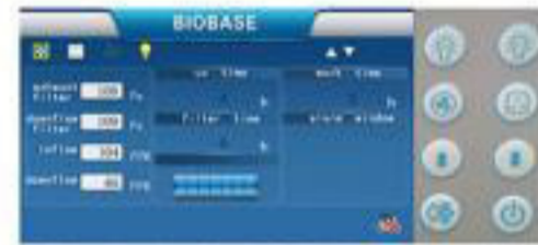
LCD display for BSC-3FA2-NA(3')