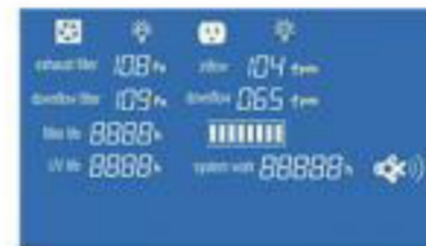
LCD display for BSC-4FA2-NA(4') and BSC-6FA2-NA(6')