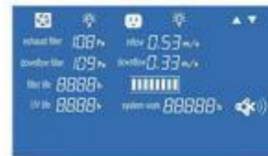
LCD display for BSC-4FA2(4'), BSC-4FA2-GL(4') and BSC-6FA2-GL(6')