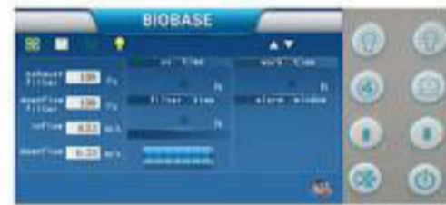
LCD display for BSC-3FA2-GL(3')

Large LCD display is easy to monitor all the safety parameters at a glance; and ergonomically sized control panel improves users interface.