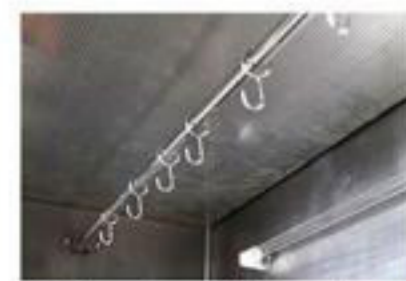
Stainless Steel I.V. Bar with 10 hooks